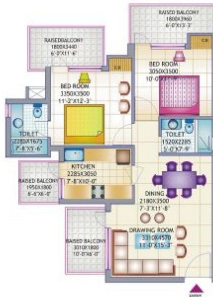
Type D : 2 BHK + 2 TOI (1200 Sq. Ft)