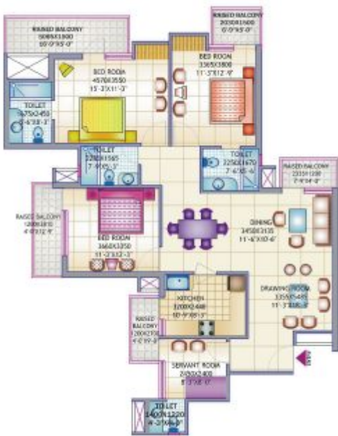
Type A : 3 BHK + 3 TOI + SER (1800 Sq. Ft)