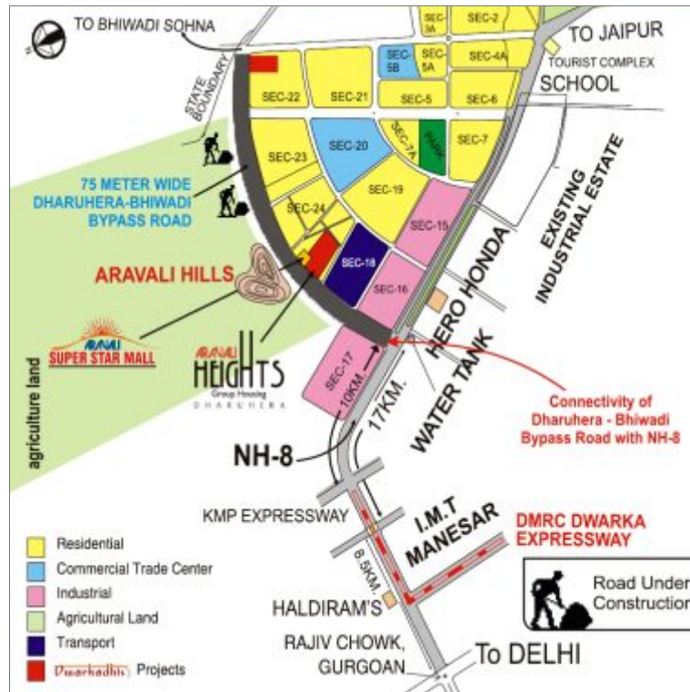
Map for Presentation Purpose Only