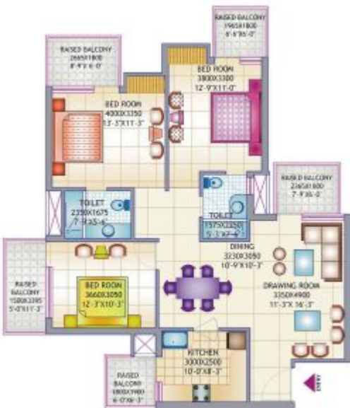
Type C : 3 BHK + 2 TOI (1500 Sq. Ft)