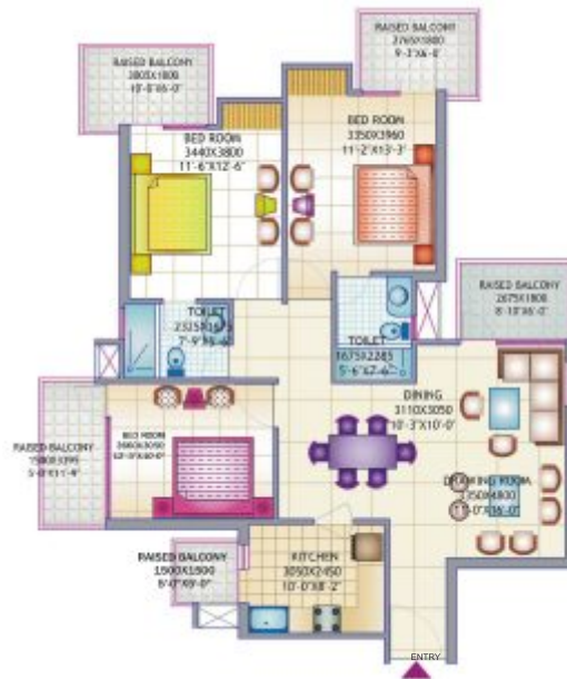
Type B : 3 BHK + 2 TOI (1500 Sq. Ft)